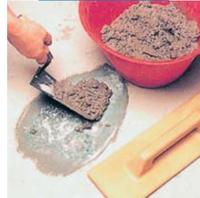
Floor patching: application of mortar

Tools and hands can be cleaned with water before the mix dries. Cleaning is very difficult after the mix has dried; solvents, such as white spirit, may be helpful.