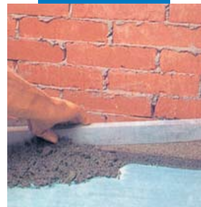
Applying cement screed modified with Planicrete SP