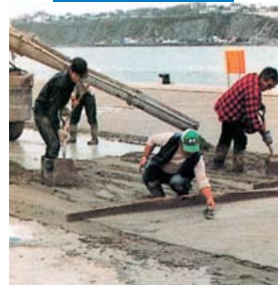
Exterior flooring with concrete admixed with Planicrete SP .