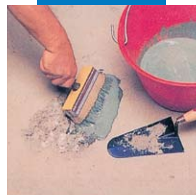
Floor patching: application of slurry