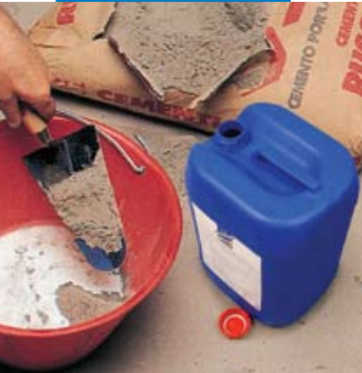
Mixing cement mortar with Planicrete SP for tile fixing