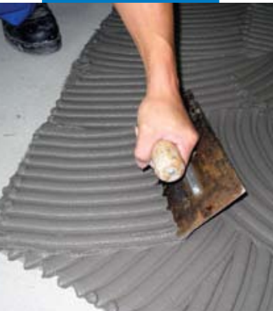
FIXING OF TILES Apply the adhesive onto the prepared substrate using a notched trowel. Do not spread more than 1m 2 at a time.