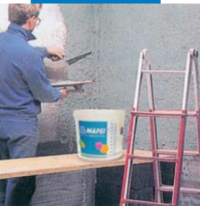
Wall render admixed with Planicrete SP