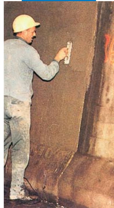
Cement plaster with Planicrete SP .

All relevant references of the product are available upon request