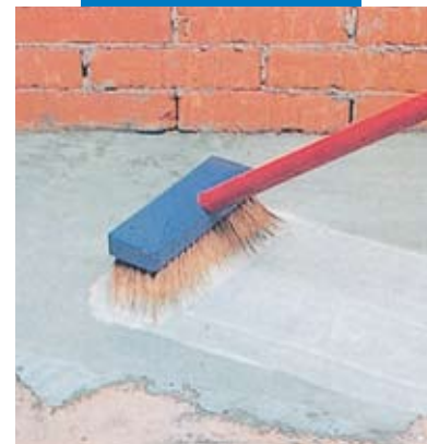
Applying cement slurry modified with Planicrete SP