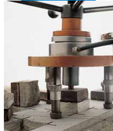
SATTEC adhesion test