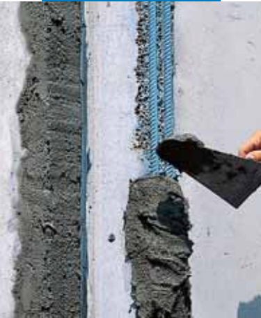
Application with trowel