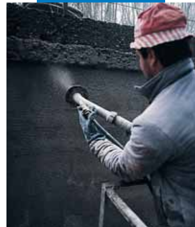
Bertini hydroelectric canal - Robbiate (Como) - Italy: spray application