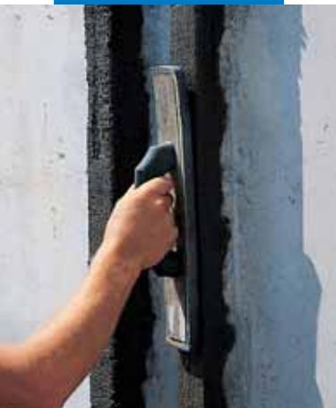
Finishing with a sponge float