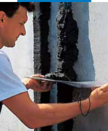
Shaping the screed