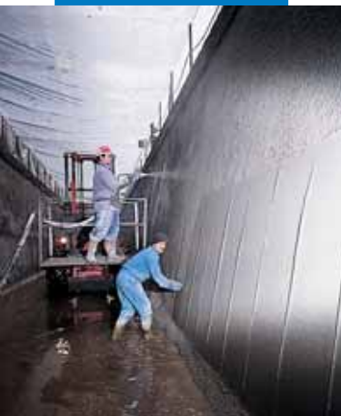
Bertini hydroelectric canal - Robbiate (Como) - Italy: finishing with a trowel

All relevant references for the product are available upon request and from www.mapei.com.au