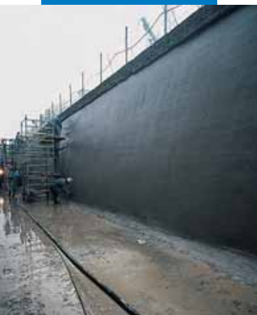
Bertini hydroelectric canal - Robbiate (Como) - Italy: General view