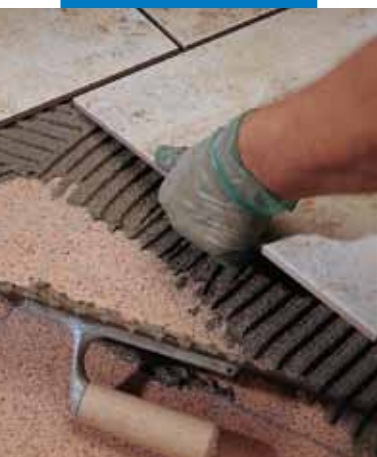
Single-fired tile on terrazzo tile of an external wall

– waterproofed membranes in Mapelastic or Mapegum WPS .