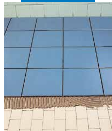
Tile on tile with Keraflex grey