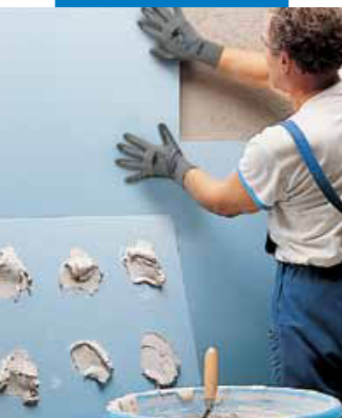
Fixing polystyrene foam slabs with Keraflex white