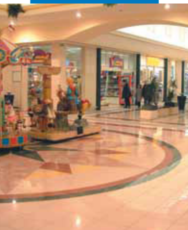
An example of an installation of porcelain tiles - Zanchetta Shopping Centre - Treviso (Italy)