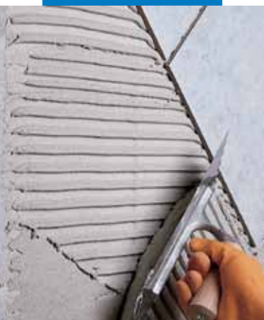
Installation of single-fired tile on expanded foam concrete block walls