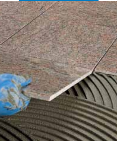
Installation of pre-glossed marble on floors