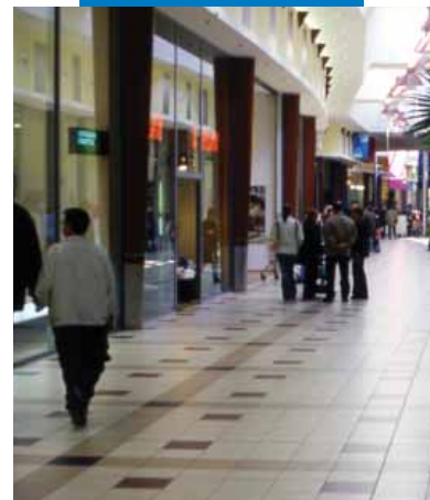
Kingcross Shopping Centre - Zagabria - Croatia

N.B. The technical data of Kerabond T mixed with Isolastic are on the latter's technical data sheet.