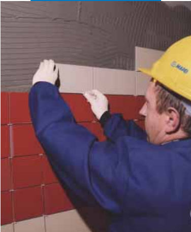
Fixing ceramic tiles on walls working from the top to the bottom

Tiling installed with Kerabond T must not be subject to washout or rain for at least 24 hours and must be protected from