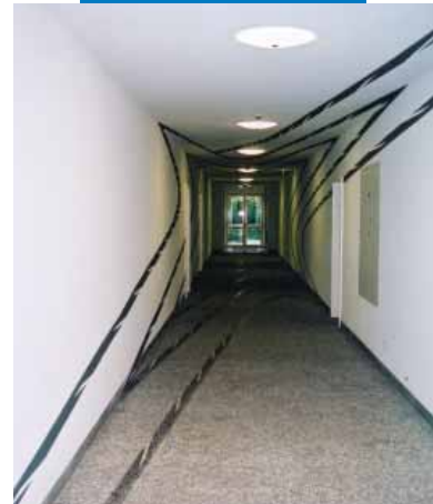
Alliance insurance offices - Munich - Germany