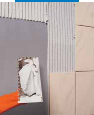
Mrázovka Tunnel - Prague - Czech Republic