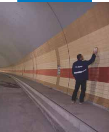
Mrázovka Tunnel - Prague - Czech Republic