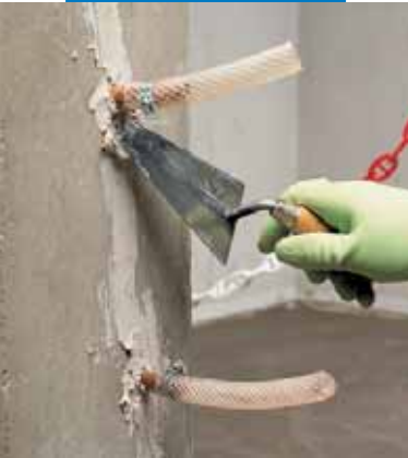
Fixing injection tubes and sealing cracks for structural consolidation

Adesilex PG1 and Adesilex PG2 are dangerous for the aquatic organisms: do not release to the environment.