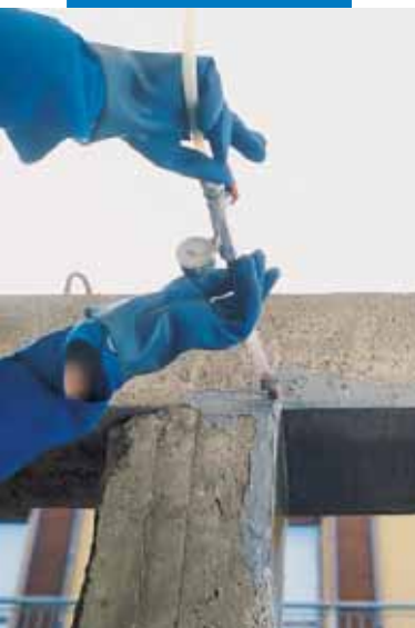
Column clad with Adesilex PG1