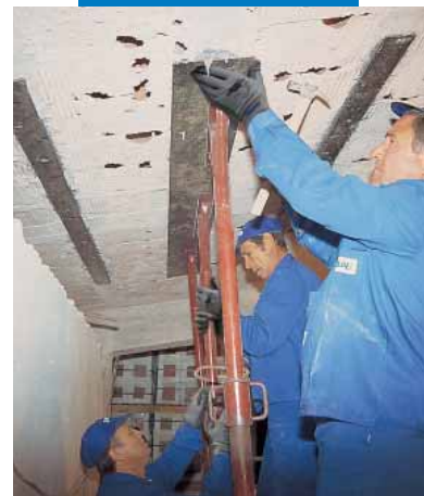
Placing metal sheet for structural reinforcement