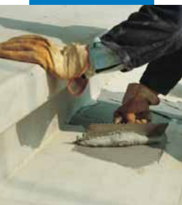
Application of Adesilex PG1 with a notched trowel for structural bonding of pre-fabricated steps