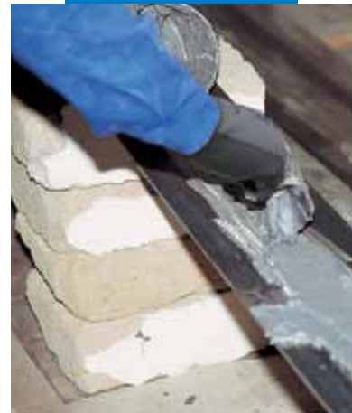
Application of Adesilex PG1 on metal sheet